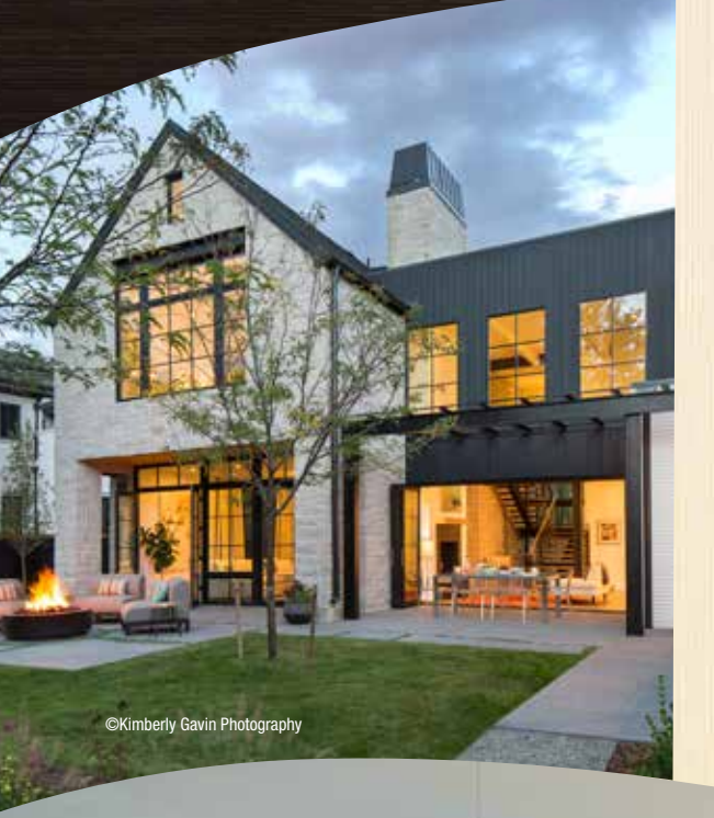
ye-h photography | Prentiss + Balance + Wickline Architects

In coastal areas there's often a balancing act between embracing the view and building with strength to overcome storms, so you'll be very glad to hear about another Sierra Pacific first. Our new FeelSafe bi-fold doors are the first true aluminum clad exterior/wood interior bi-fold doors on the market that meet Zone IV/HVHZ requirements.